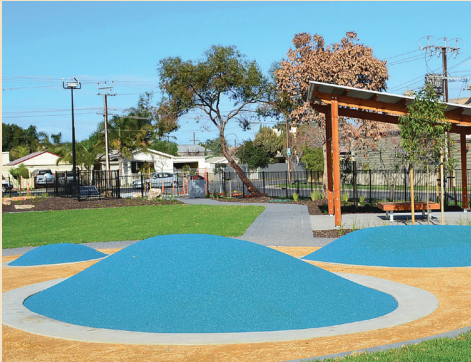
Rubber Play Mounds